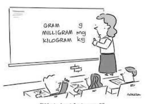
"What about Instagram?"

Manakau Dairy is very supportive of our school, please support them also.